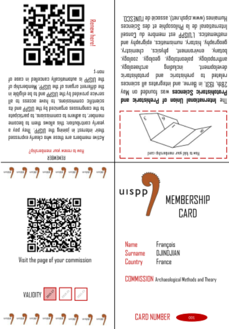
UISPP membership card